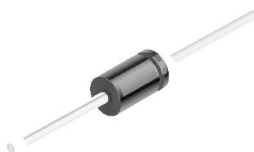
DO-41 Glass case COLOR BAND DENOTES CATHODE